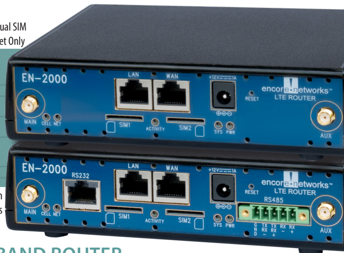
EN-2000™ Dual SIM with Ethernet Only