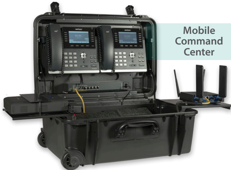
Mobile Command Center

The MCC is an all-in-one solution. The MCC is a rugged case designed to fit into overhead airline storage or any small space. It comes with two phone sets that are tied to your corporate numbers for emergency repair, network operations, site management and more. A hardened EN™ router from Encore Networks is included to provide mobile connectivity using Verizon nationwide LTE coverage along with support for both voice and sub-station PLC SCADA connectivity using either serial or Ethernet. Includes imbedded Wi-Fi for onsite "hot spot" of other personal devices, phones, tablets, and printers if needed. The MCC has an eight (8) hour battery for constant talk time before needing charging, or can be plugged into an external AC power source for continuous operation.