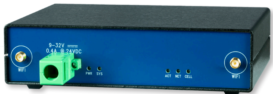
EN-2000™ Back Panel Pictured with Terminal Block Connector

In addition, the Encore Networks EN-2000™ Automotive Router can be monitored and managed with Encore's Enterprise Management System enCloud™. enCloud™ offers many features that will make managing your entire network of EN™ Series routers easier, including Cellular data limit enforcement for individual devices and group data plans, included firmware updates, no touch deployment for new hardware, and reseller and customer tiers to assist in delivering managed network services for multiple customers.